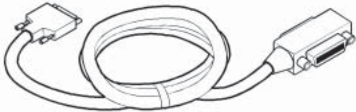
HP-IB cable required by the TAMS interface.

Depending on the computer, it may be advisable to connect the small Cannon connector of the required HP-IB cable to the TAMS interface card prior to fully seating the PCI board. Ensure that the thumbscrews and the small connector are tight for a good connection.